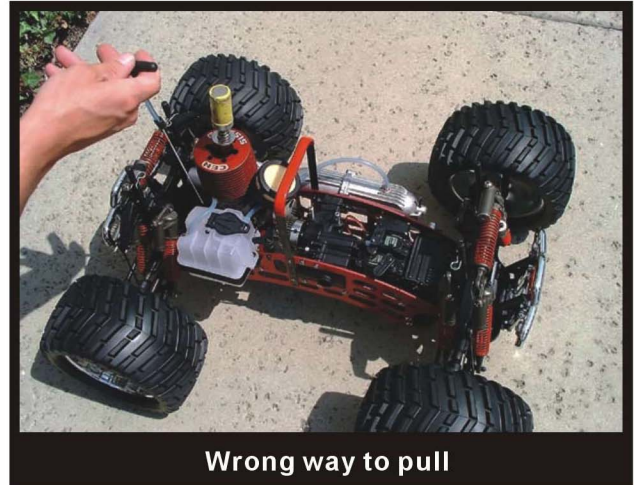
Wrong way to pull

Make sure you pull the cord out to the side and not up. Pulling the cord up like shown in the picture on the right will cause the cord to snap.